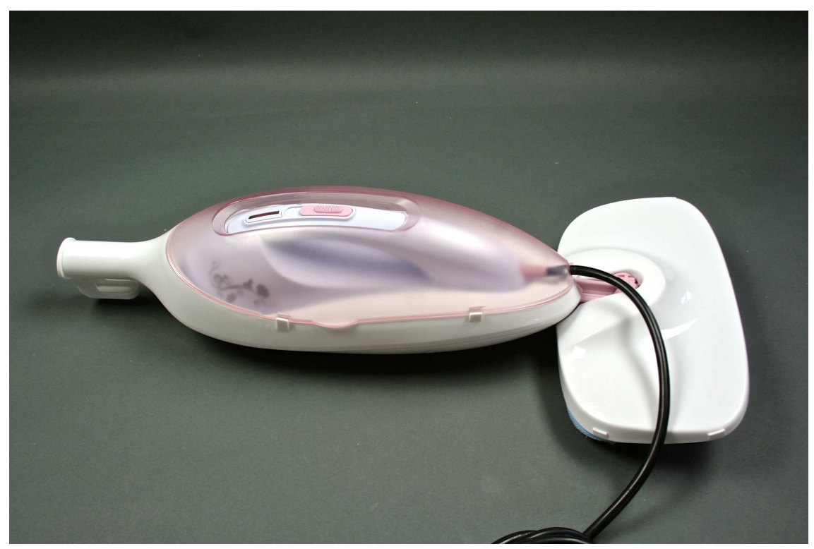
Closed pink lid.