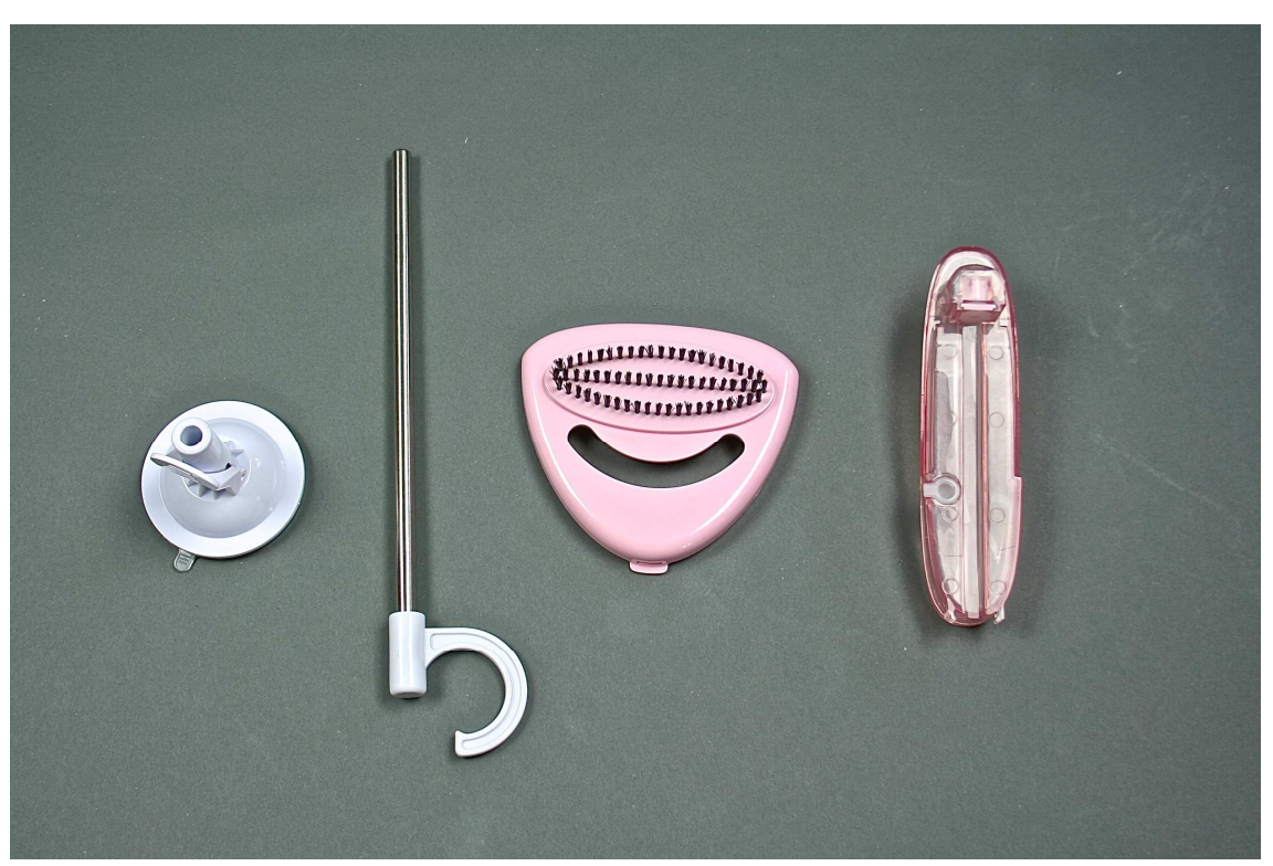
Steam ironing accessories. Clothe hanger, brush for tougher fabrics (snap on), smaller water tank for steam ironing.