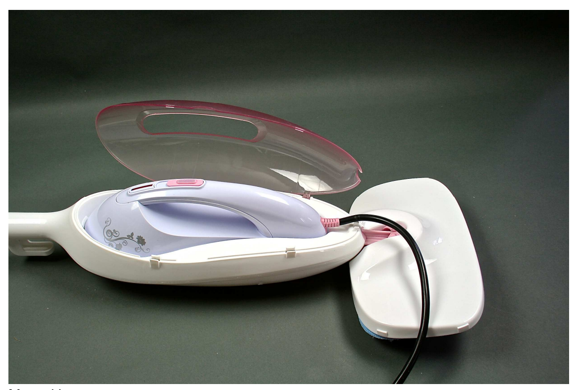
Mop with steamer.