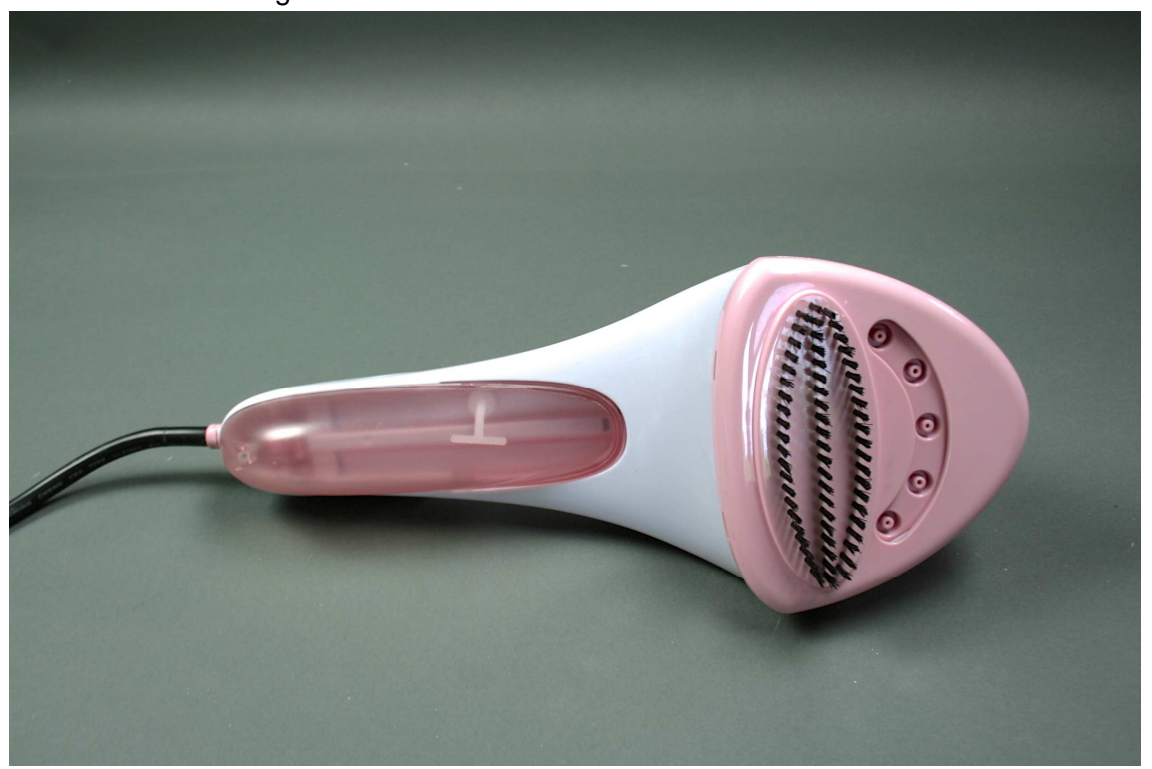
Attached steam iron brush.