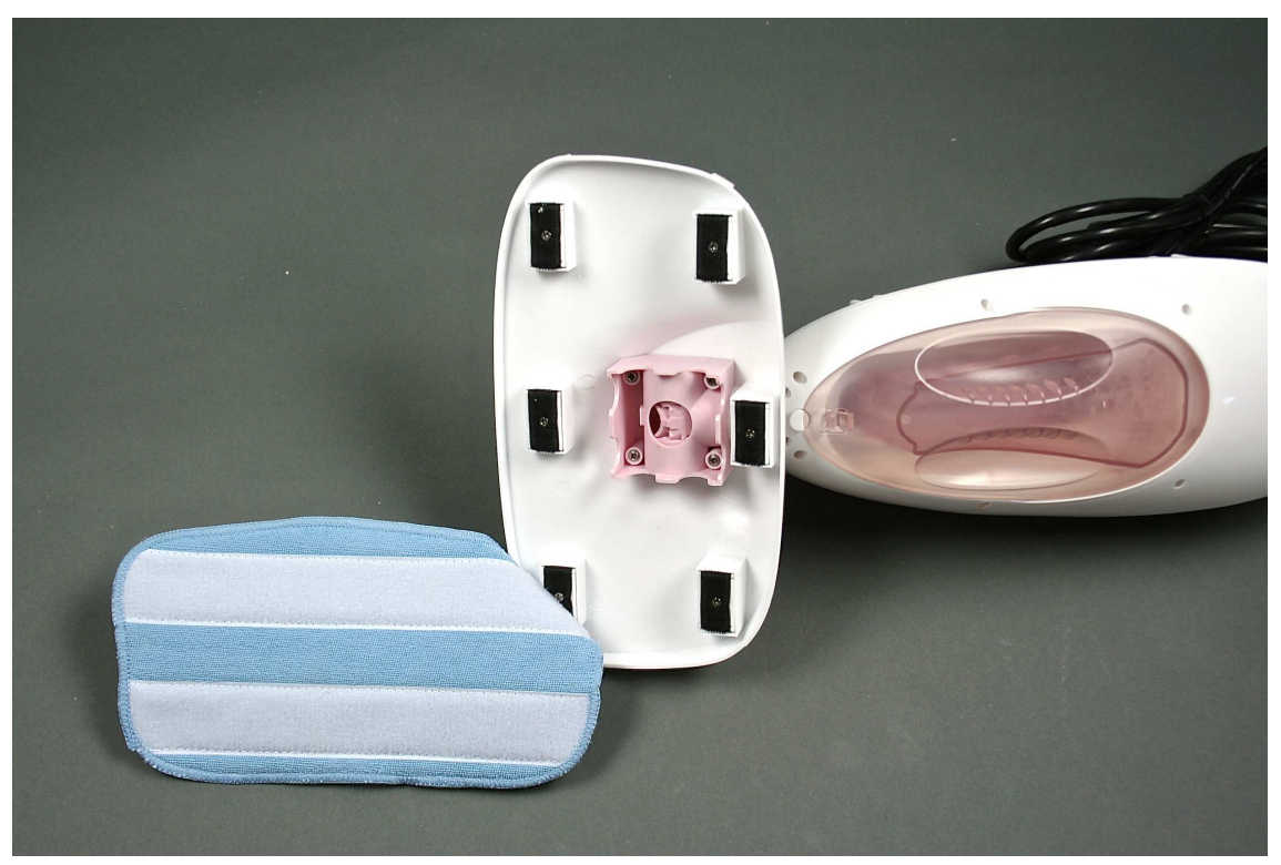
Attach pads via velcro while snap on for plastic carpet cover.